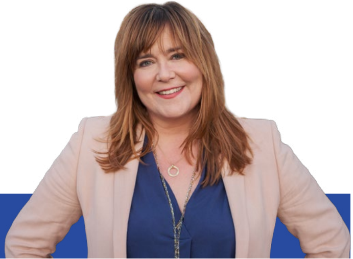
Þórdís Lóa Þórhallsdóttir President of Reykjavik City Council